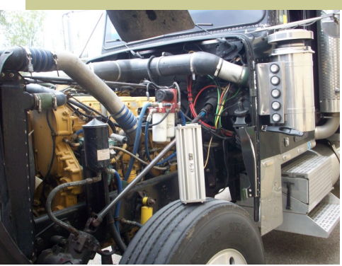
NTF AL-29 Bypass Filter

David Stufko, 1995 Freightliner truck w/ Caterpillar Model 3406E Engine with the NTF Bypass Filter system now with 2,300,000 miles as of 2012.